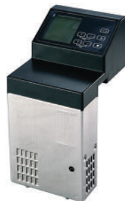
SV-120 MADE IN CHINA