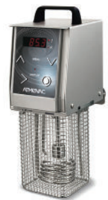
SOFTCOOKER XP 120/230 MADE IN ITALY