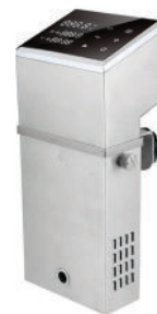
SV-310 MADE IN CHINA